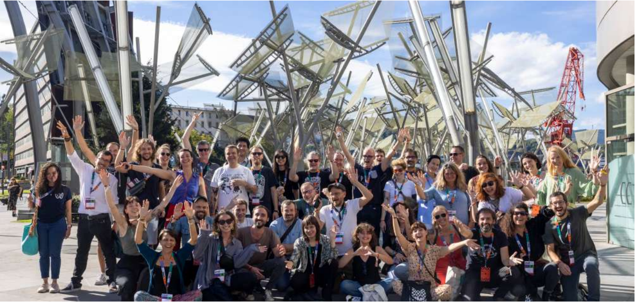
© Olga Ruiz - Bufalo Pudukzioak, Live DMA at BIME 2022

Live DMA members gathered this autumn to share their worries, fights, and get support from each other to sustain the future of the live music scenes.