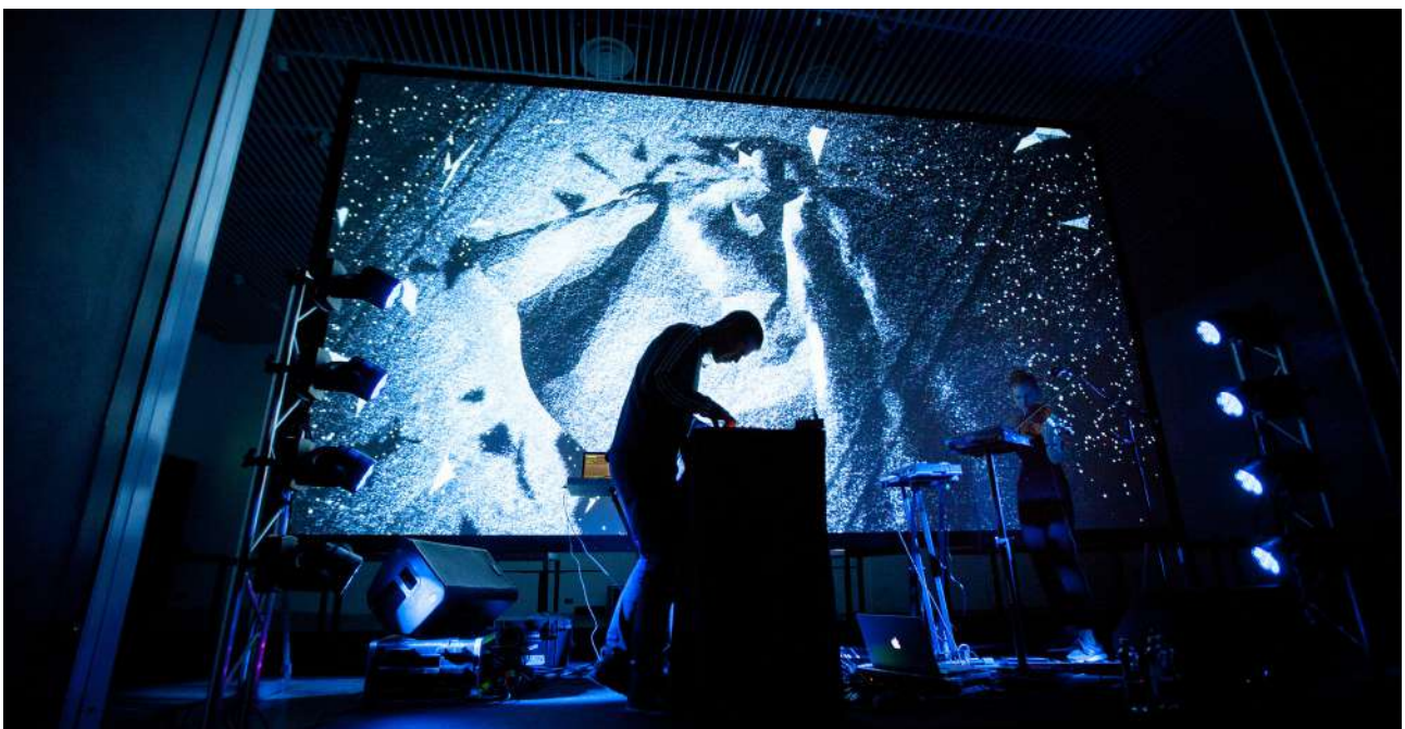
© Diana Pshkovich, Tallinn Music Week 2021

This trend should be taken into consideration seriously, as it does not only represent a short-term threat for emerging artists but for the whole music ecosystem that relies on the live music scenes' landscape to develop the artists careers.