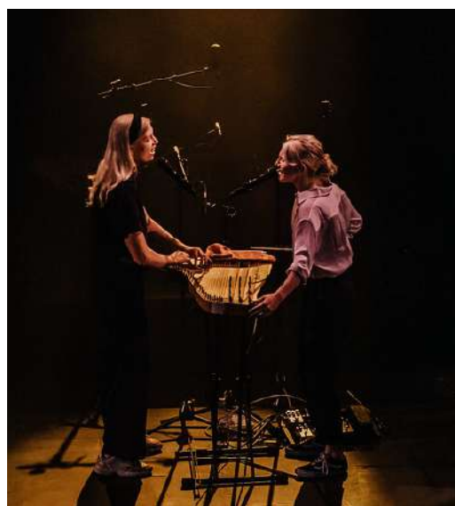
© Duo Ruut, Tallinn Music Week 2022

Venues and clubs face high inflation in 2022, especially for energy, but also for other expenditure such as accommodation costs, workers costs, and catering purchase. They also face a lack of income, independently of their financial model. The venues mainly relying on subsidies struggle since the latter have not increased enough to compensate inflating costs, and the venues mainly relying on audience income struggle to attract music lovers: tickets and catering prices are rocketing, triggering an accessibility concern for audiences that might become priced out of live music. Venues and clubs are then battling to maintain an accessible offer to develop and engage with audiences, who are worried about recession and general living costs and do not prioritize gig tickets.